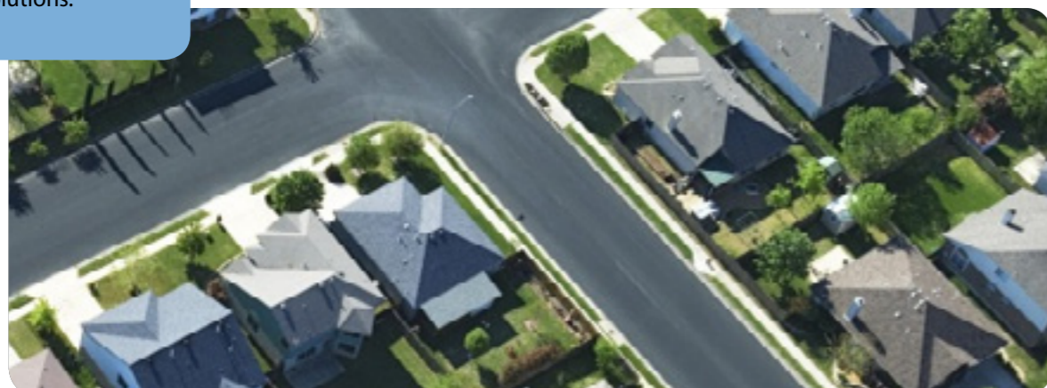
Nubian helps build sustainable communities

This water can be reused for internal applications such as toilet flushing and laundries, as well as for external applications such as irrigation and vehicle washing.